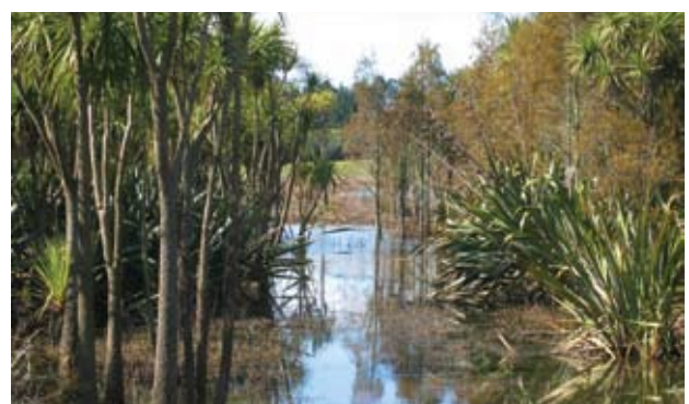
Environmental award winning Waiatarua Wetland.