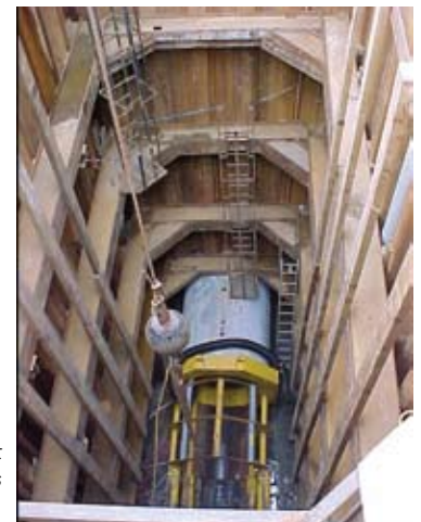
Deep jacking pit for new trenchless stormwater pipeline.