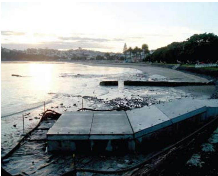
The Parade pipeline outfall at St Heliers beach prior to construction of artificial reef surrounds.

Auckland is the largest city in New Zealand and its Council consists of the Mayor and 19 Councillors. The Works and Services Committee was responsible for policy decisions relating to stormwater services. The Council spends around $19 million each year operating the stormwater system and around $26 million on capital projects. Metrowater undertakes some of the stormwater operation and maintenance activities on behalf of Auckland City.