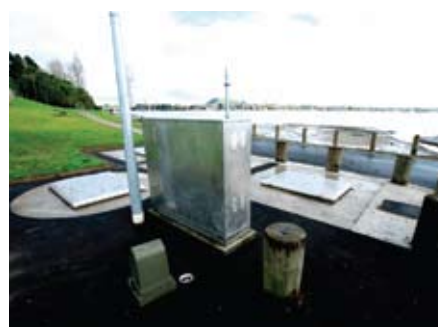
Upgraded wastewater pump station Fisher Parade, Pakuranga.