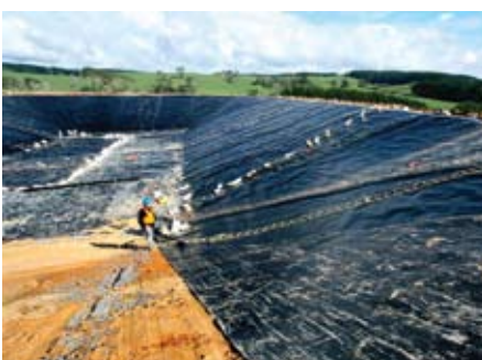
Beachlands/Maraetai wastewater treatment pond.

On 3 July 2006 the water and wastewater assets of Manukau City Council were transferred to Manukau Water Limited, a Council Controlled Organisation (CCO) for the purposes of the Local Government Act 2002. Manukau Water Limited is a separate company, 100% owned by Manukau City Council, with its own Board of Directors, Statement of Intent, Chief Executive, vision and mission statement. The company serves approximately 328,000 people living in an area covering 552 square kilometres. It manages infrastructure assets worth nearly $1 billion.