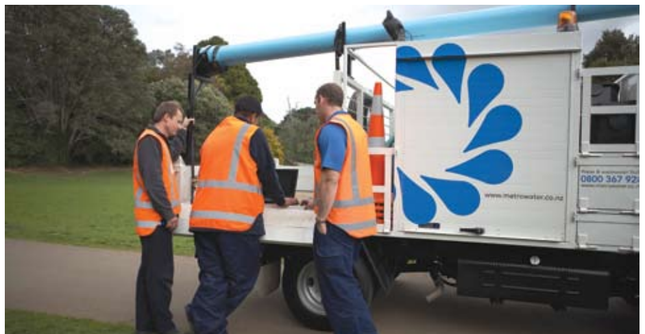
Metrowater maintenance crew

to see further progress on our sewer separation programme under the Clear Harbour Alliance and, day-to-day, we will continue to meet and exceed our customers' expectations.