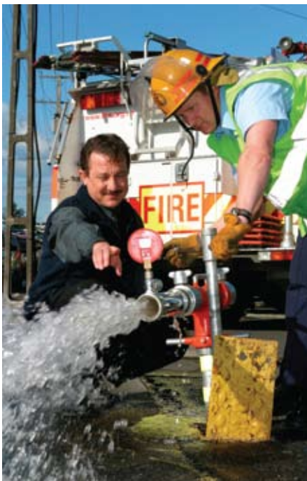
Fire flow testing with hydrant standpipe and flow meter.

In addition, we have achieved some other significant results: