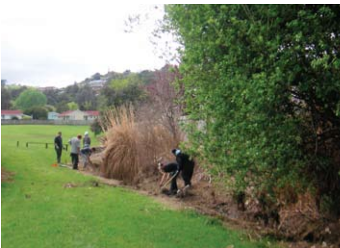
Community cleaning up the open drain along Keri Down Reserve during the Great Spring Clean Day in Papakura.

Papakura District Council consists of the Mayor and 8 Councillors. Over 2006/07 the Council's Operations and Monitoring Committee was responsible for policy decisions relating to stormwater services and for oversight of the water and wastewater services provided by United Water. The Council spent around $2.5 million in 2006/07 operating the stormwater system including depreciation with around $7 million spent on capital projects including vested assets through developments.