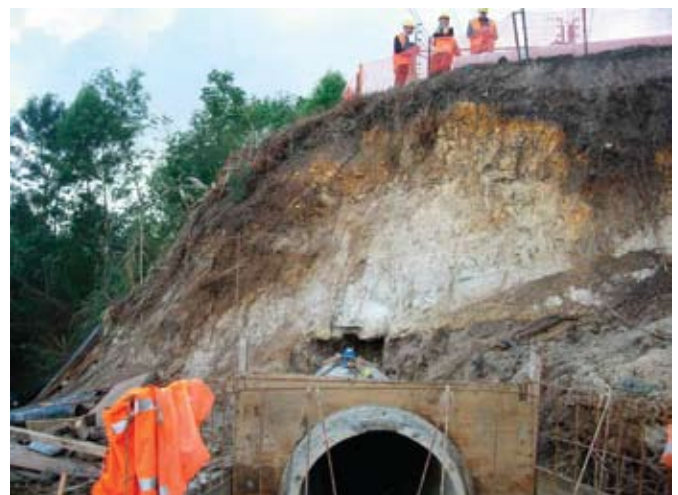
Micro-tunnelling project to cater for current growth in Takanini using a concrete pipe with additional sacrificing layers for the peat soil environment.