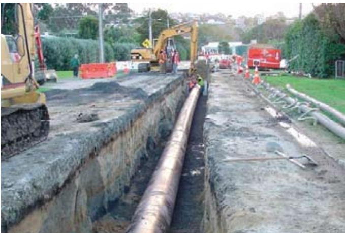
Trunk sewer main at Manly, Hibiscus Coast, part of the trunk main connecting Orewa to the Army Bay Wastewater Treatment Plant.

Rodney District covers the largest land area of the seven territorial authorities in the Auckland region. While the vast majority of the district's land is rural, most people live in urban areas. Its Council consists of the Mayor and 12 Councillors. Water supply, wastewater and stormwater services are provided by the Council's Water Services Department. Over 2006/07 the Council's Assets Management Committee was responsible for policy decisions relating to the three waters. The Council spends around $28 million each year operating its total water operations and $32 million annually on capital projects for the next 10 years.