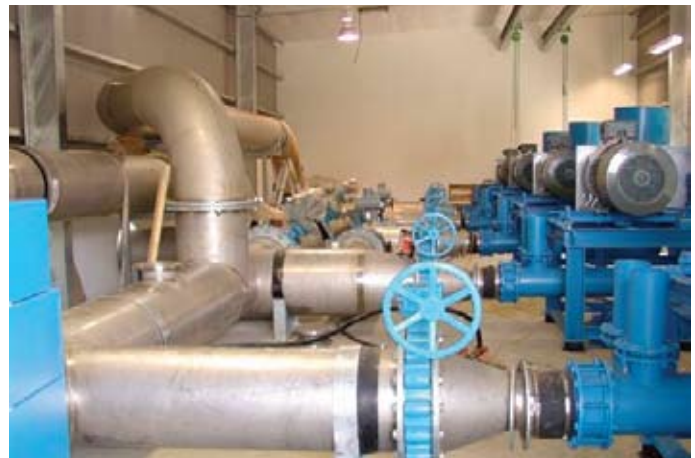
Army Bay Wastewater Treatment Plant blower room which supplies three Sequential Batch Reactors with oxygen to aerate the effluent.