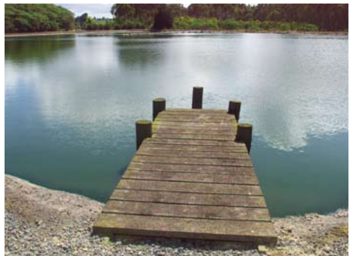
Drury Wastewater Treatment Plant is no longer operational and is scheduled for decommissioning and land remediation in 2008.