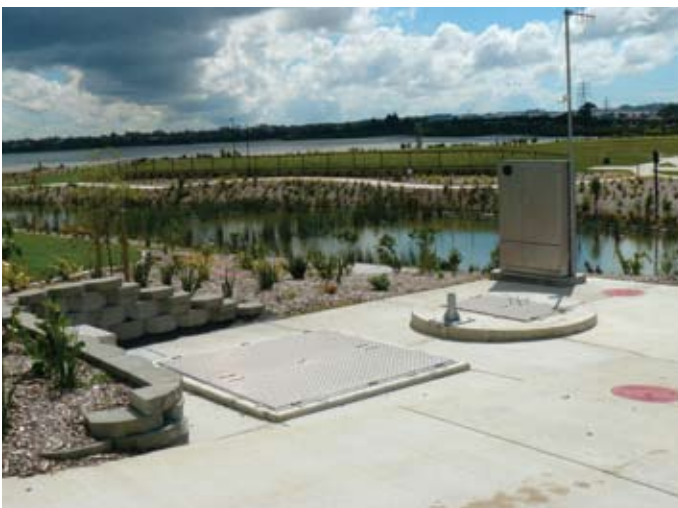
Karaka Harbourside is a major new development on the Hingaia Peninsula with around 220 lots now available for development and a further 200 lots expected in stages 3 and 4. United Water has ensured the supply of all water and wastewater infrastructure to the area.

United Water provides water, wastewater and stormwater services to 1.5 million people in Australia and New Zealand. United Water has a 30 year franchise agreement with Papakura District Council to manage, operate and maintain the water and wastewater systems in the District. United Water's parent company is Veolia Water, the world's largest water company.