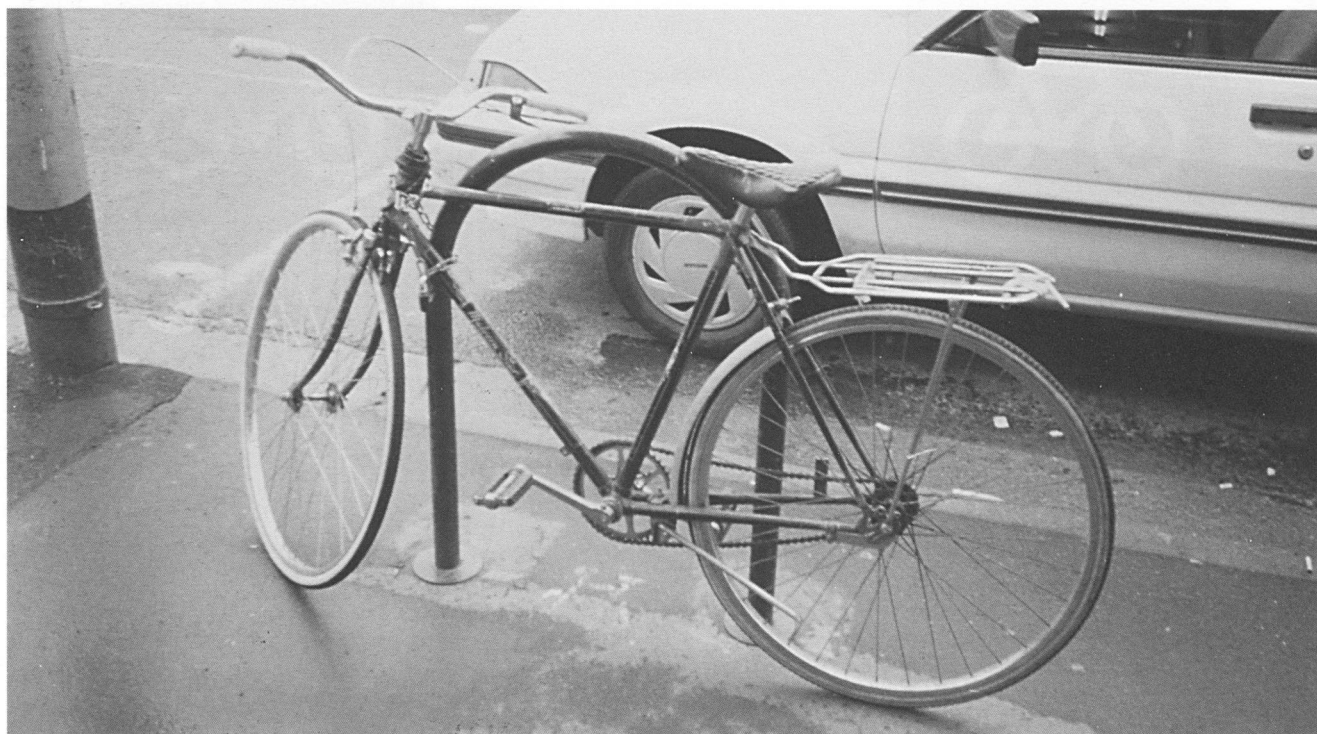
Figure 10-17: Single Rail Outside Shop

It is suggested that the bicycle rails shown in Figure 10-8 and Figure 10-10 should have a small painted bicycle pavement symbol (Figure 10-16) painted on the pavement beneath them so that the purpose of the rails is clear. An alternative is to stencil 'Bicycle Parking' on the device.