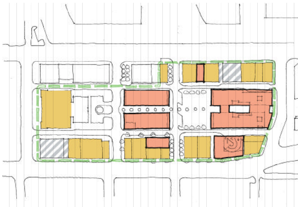
The Bluewater Consortium's concept plan for the Britomart precinct

The redevelopment of the Britomart Precinct includes the conservation and adaptive reuse of the buildings along Customs Street between the Mercure Hotel and Britomart Place, those on Quay Street between Britomart Place and Gore Street and the completion of the Central Post Office conservation project.