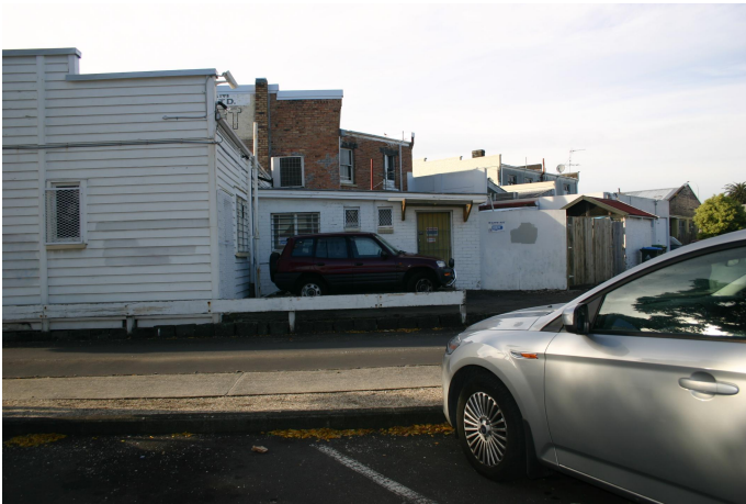
Side /rear view