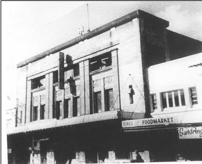
Pickering Building visible at right side of Mayfair cinema. Auckland Institute and Museum Library Neg. M102 (a,b,c).