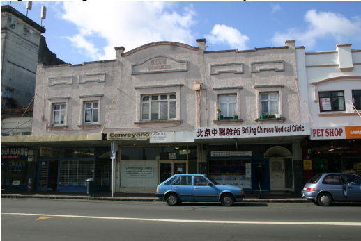
The design of the Tollemarche Building is similar to building at 628 Dominion Road which was also built in the 1920s. It may have been designed by the same architect, or reflect contemporary trends in the design of these building types.