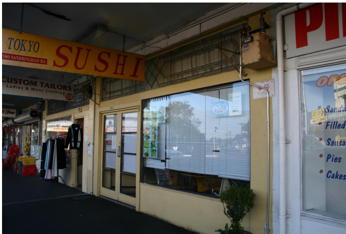
Original shop front detail remains including leadlight top lights, and timber window joinery.