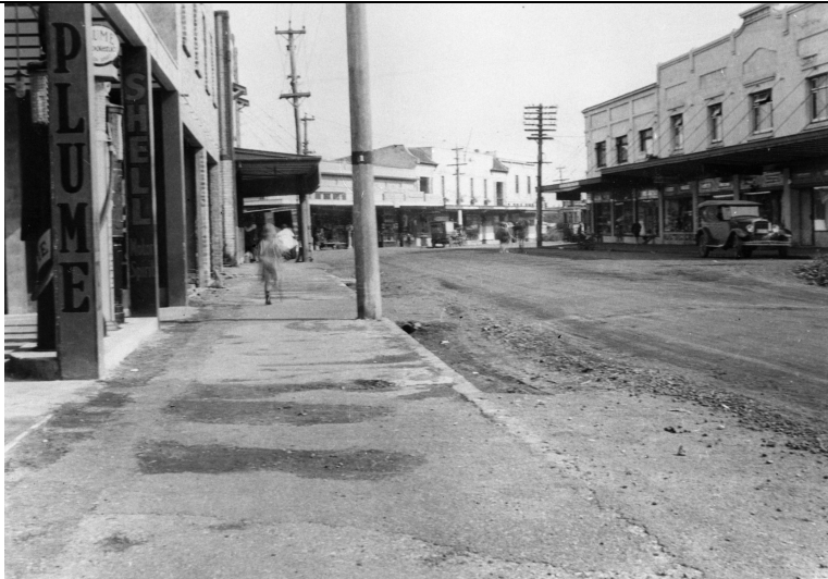
Sandringham Shopping Centre with the Tollemarche Building at the right. Auckland Institute and Museum Library C 23272