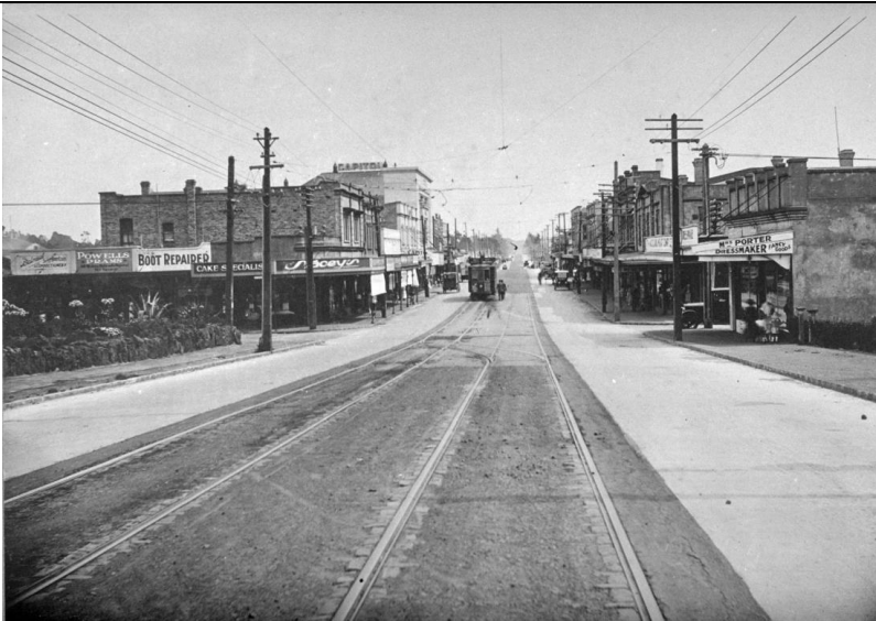
Dominion Road looking towards the Balmoral shopping centre in the 1920s. The building can be seen adjacent to the Capitol Theatre. 10950