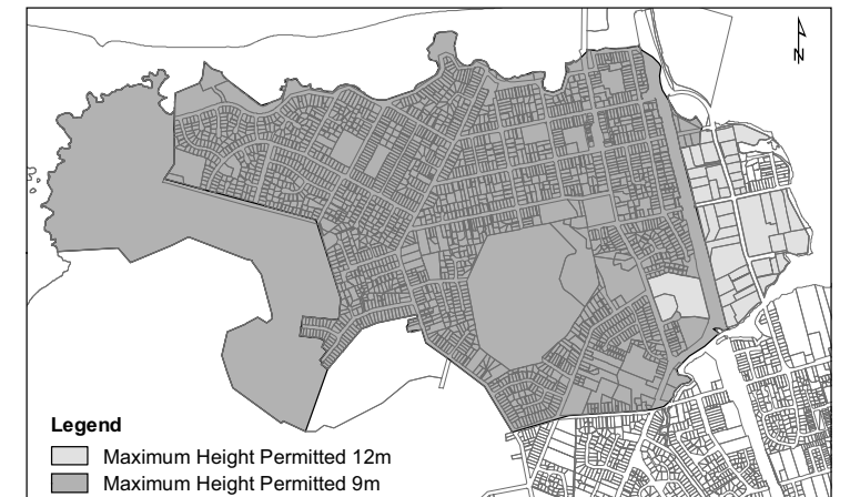
MANGERE BLANKET HEIGHT RESTRICTION ZONE: The area depicted on this map identifies maximum height limits that the Auckland Regional Council consider important in the terms of protecting regionally significant views (See 13.13.7.2.1 (d) (ii)) SOURCE: Auckland Regional Council Proposed Regional Policy Statement 1995 Map Series 4, Sheet 5