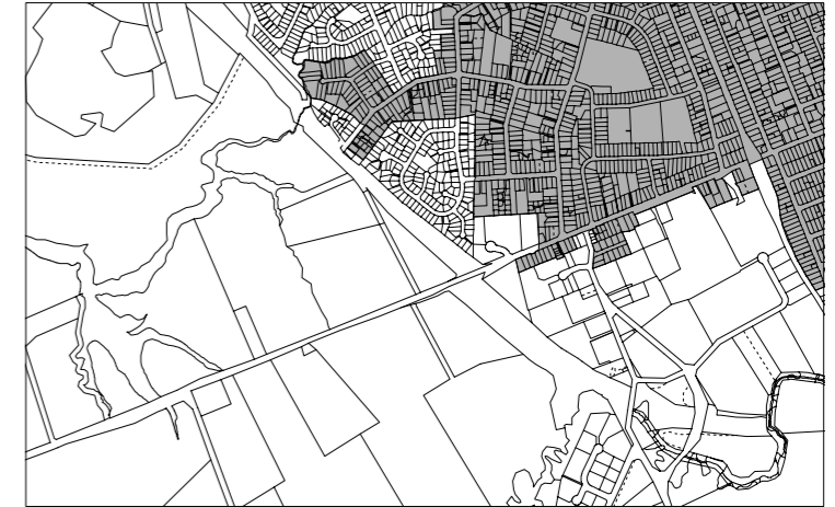
Special (Front Yard) Policy Area 3 (Papatoetoe) Refer to Yard Table Rule 13.11.1.5.1