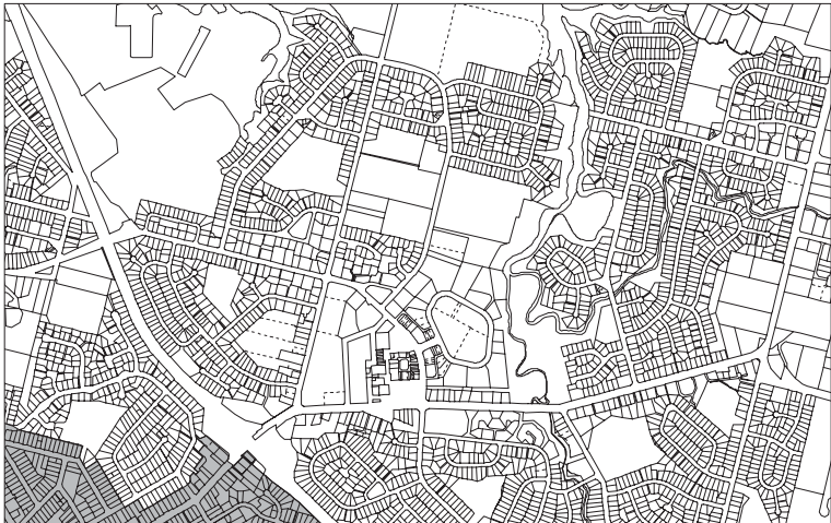
Special (Front Yard) Policy Area 3 (Papatoetoe) Refer to Yard Table Rule 13.11.1.5.1