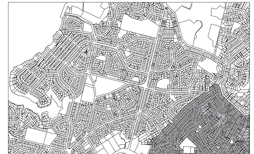
Special (Front Yard) Policy Area 3 (Howick) Refer to Yard Table Rule 13.11.1.5.1