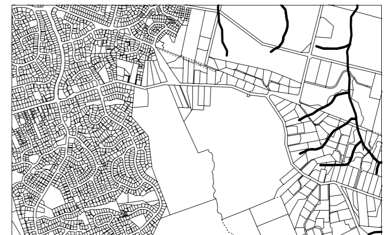
i Limited Drainage Infrastructure Very Limited Drainage Infrastructure — Protected Stream