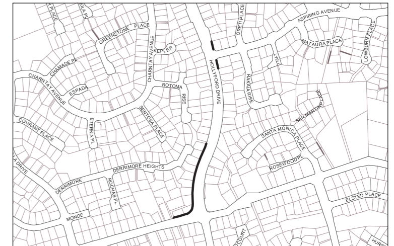
— Spite Strip - Public Open Space