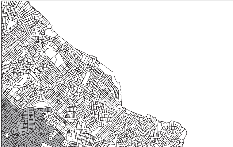
Special (Front Yard) Policy Area 3 (Howick) Refer to Yard Table Rule 13.11.1.5.1