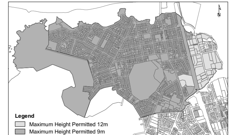
MANGERE BLANKET HEIGHT RESTRICTION ZONE: The area depicted on this map identifies maximum height limits that the Auckland Regional Council consider important in the terms of protecting regionally significant views (See 13.13.7.2.1 (d) (ii)) SOURCE: Auckland Regional Council Proposed Regional Policy Statement 1995 Map Series 4, Sheet 5