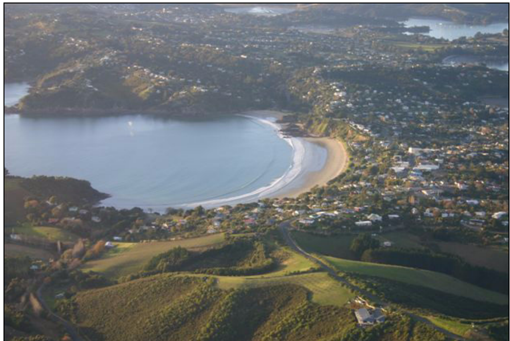
Figure A12.1 Oneroa from the air