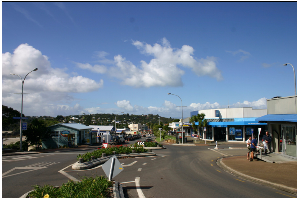
Figure A12.2 Oneroa village