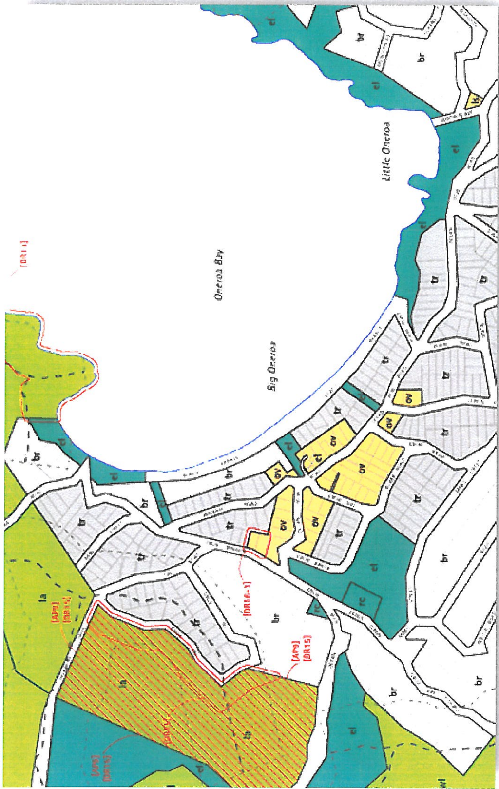
Figure 1: Proposed Plan Map 2